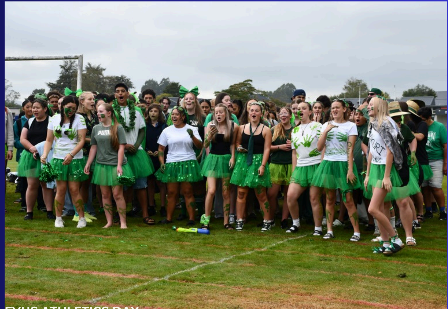
FVHS ATHLETICS DAY