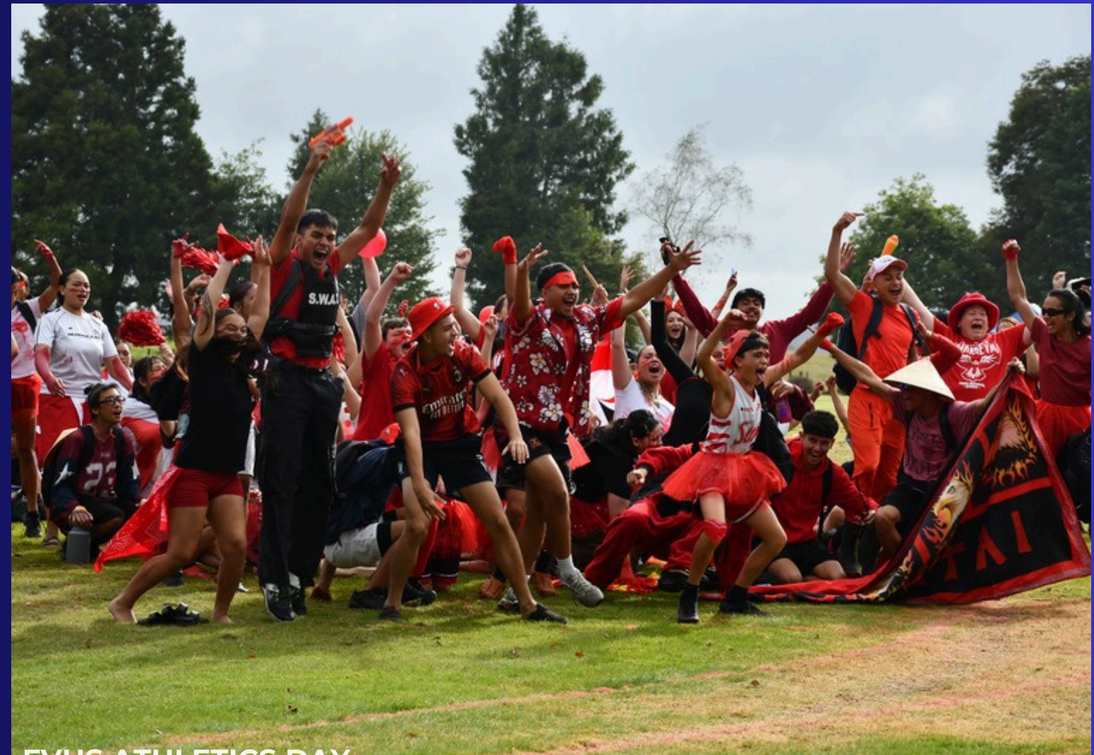
FVHS ATHLETICS DAY