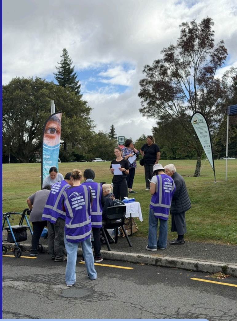
A HUGE THANKS TO SWPICS FOR GIVING OUR STUDENTS THE OPPORTUNITY TO GIVE BACK TO THE COMMUNITY AND CONNECT WITH PEOPLE IN OUR HEALTH SECTOR.