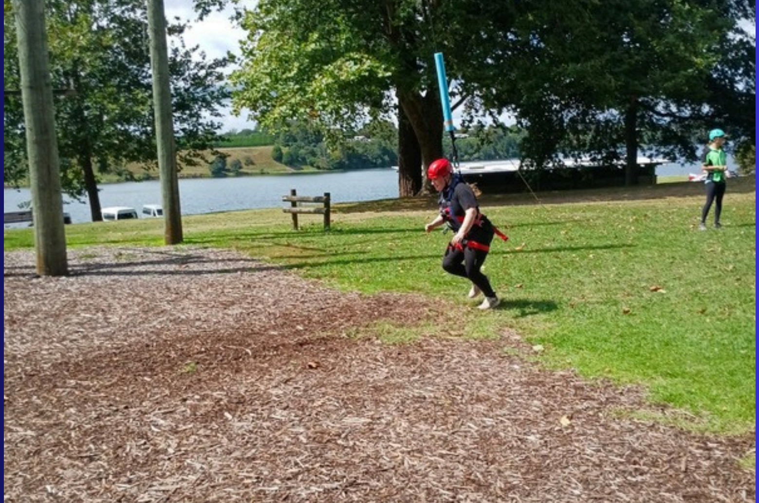
STARS MENTOR TRAINING