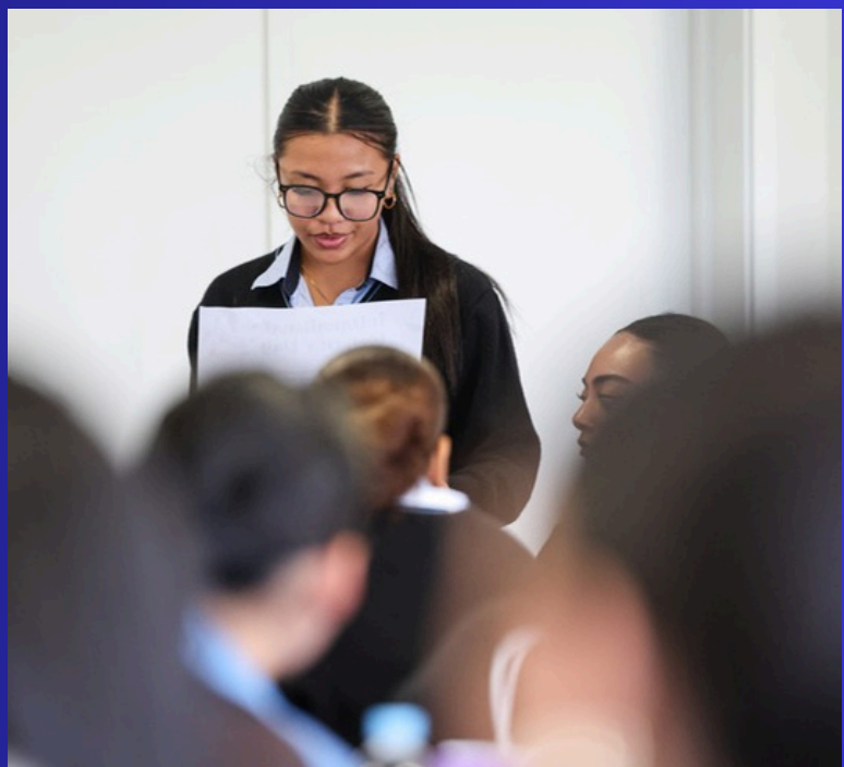
INTERNATIONAL WOMENS DAY